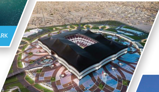
AL BAYT STADIUM