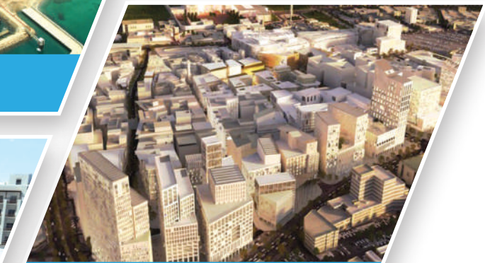
MSHEIREB - HEART OF DOHA