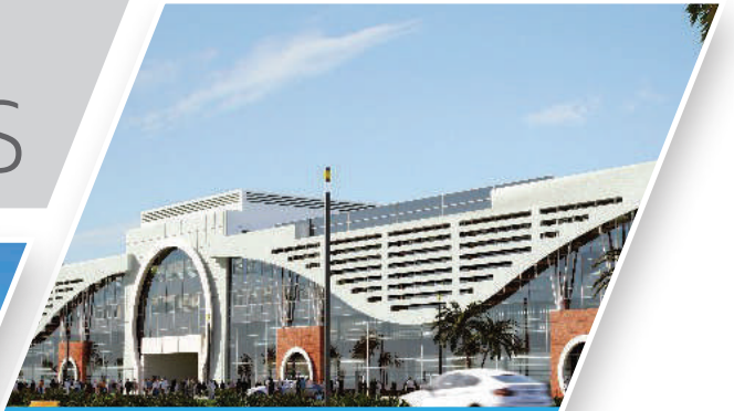
BARWA COMMERCIAL AVENUE