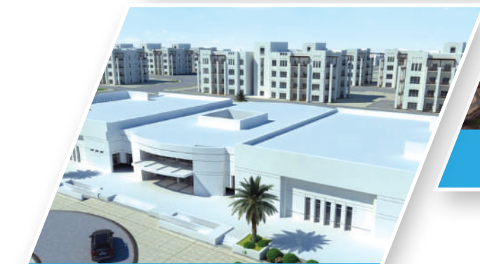
QATAR UNIVERSITY STUDENT HOUSING