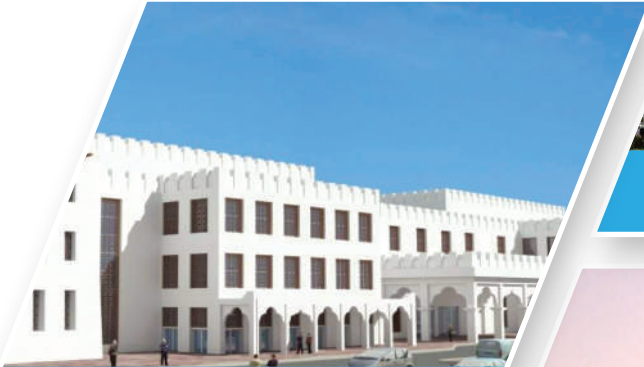
WORKERS' HOSPITAL AT RAS LAFFAN