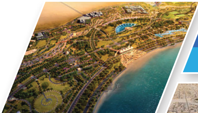
AL BIDA PARK & UNDERGROUND CAR PARK