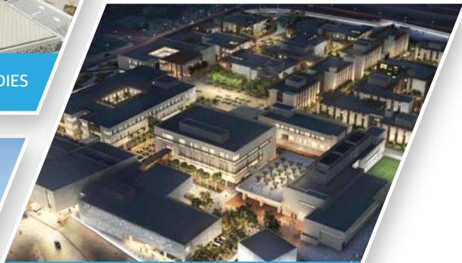
DOHA INSTITUTE FOR GRADUATE STUDIES