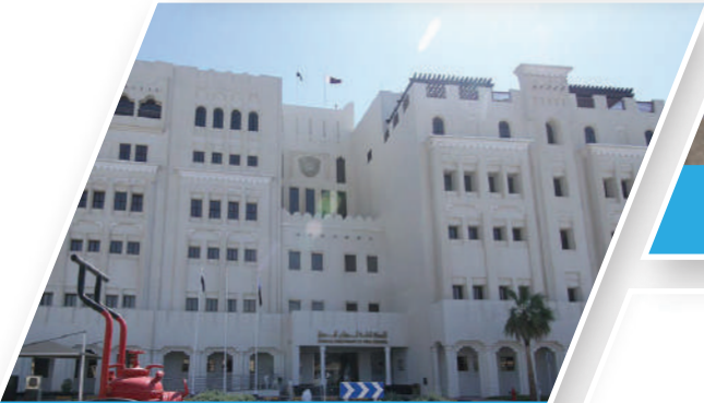
CIVIL DEFENCE HEADQUARTERS