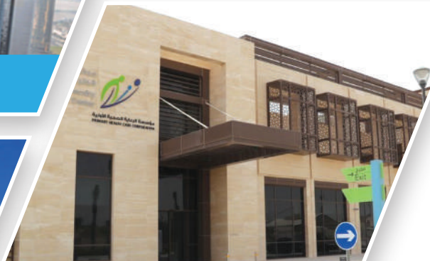
ASHGHAL HEALTH CARE CENTERS & SCHOOLS