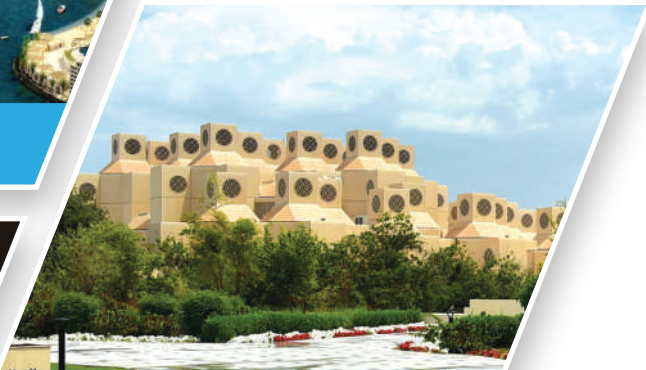
QATAR UNIVERSITY BUILDINGS