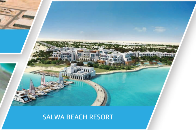
SALWA BEACH RESORT