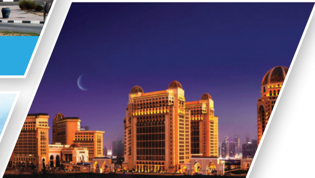
ST. REGIS HOTEL