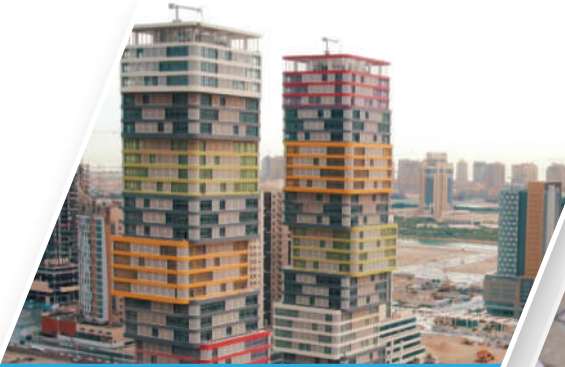
MARINA TWIN TOWER