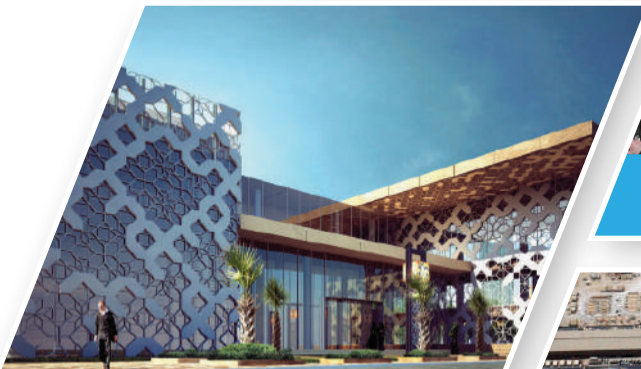
NEW COLLEGE OF PHARMACY System: Switchgear, Busduct