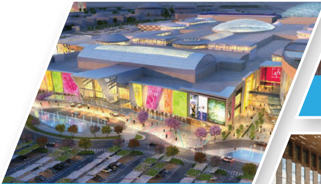
MALL OF QATAR