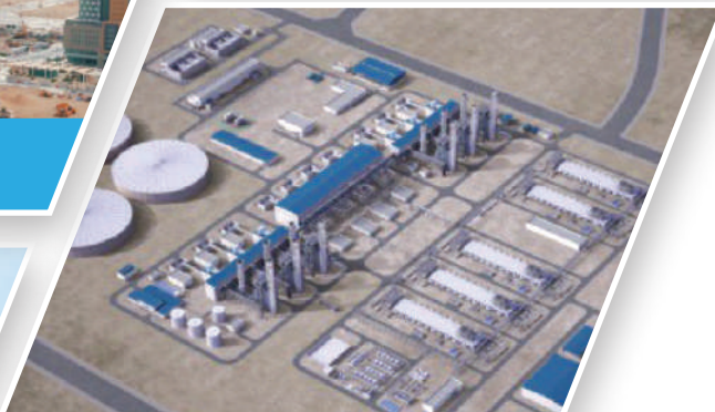
UMM AL HAUL POWER PLANT