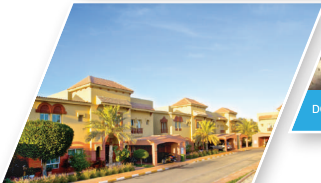
AL FARDAN BEACH VILLA