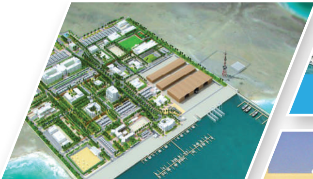
COAST GUARD BASE AT AL DAAYEN