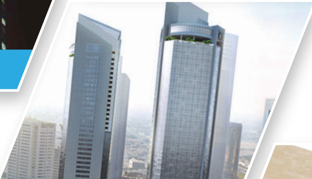
AL RAYYAN TWIN TOWER