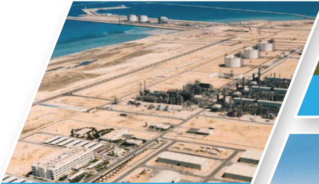
BARZAN ONSHORE PROJECT