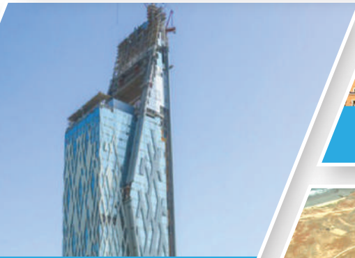
BURJ MARINA TOWER, LUSAIL