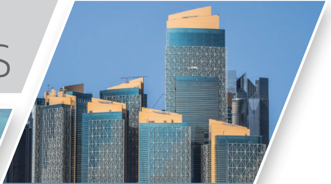
QATAR PETROLEUM DISTRICT