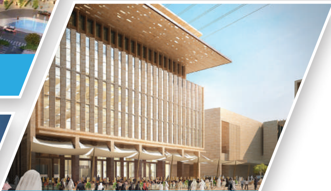
JK1 CULTURAL FORUM - MSHEIREB