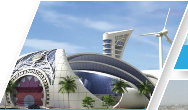
KAHRAMAA BULDING AND SUBSTATIONS