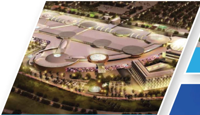
DOHA FESTIVAL CITY