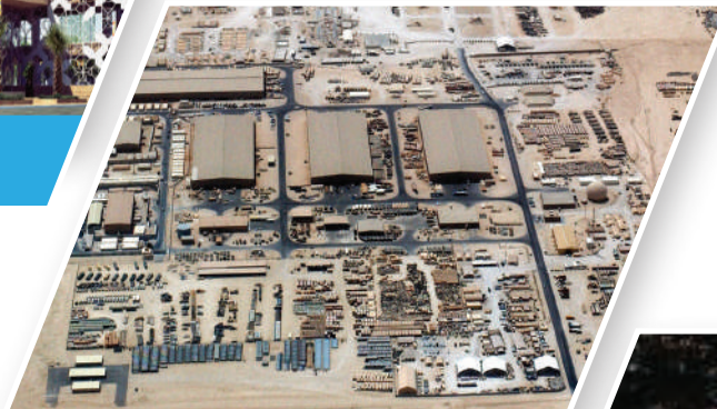
AL UDIED AIR BASE