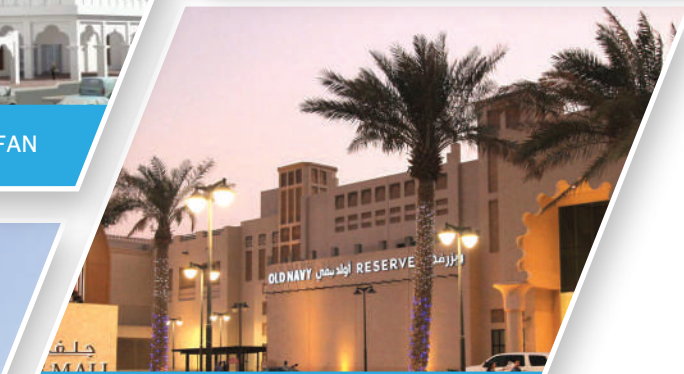
GULF MALL AT GHARAFFA