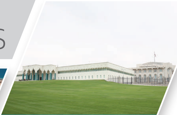
AMIRI DIWAN OF STATE OF QATAR