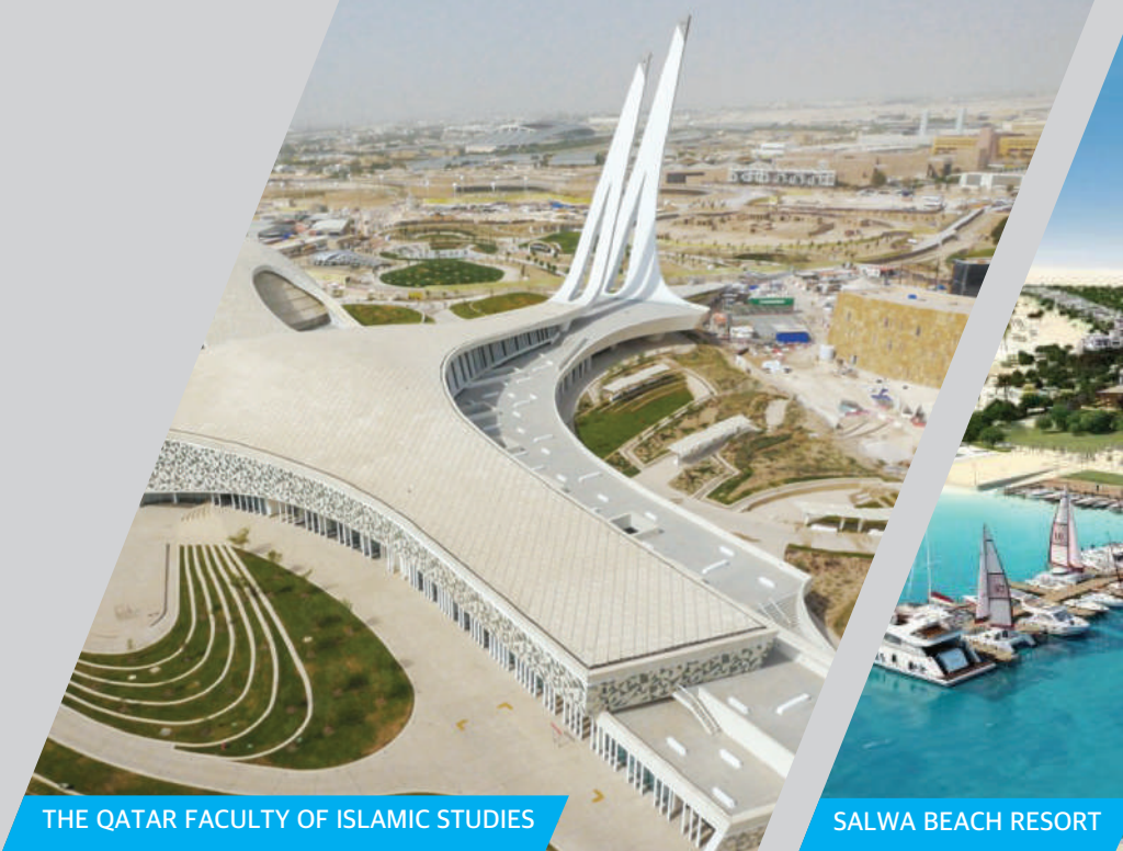
THE QATAR FACULTY OF ISLAMIC STUDIES