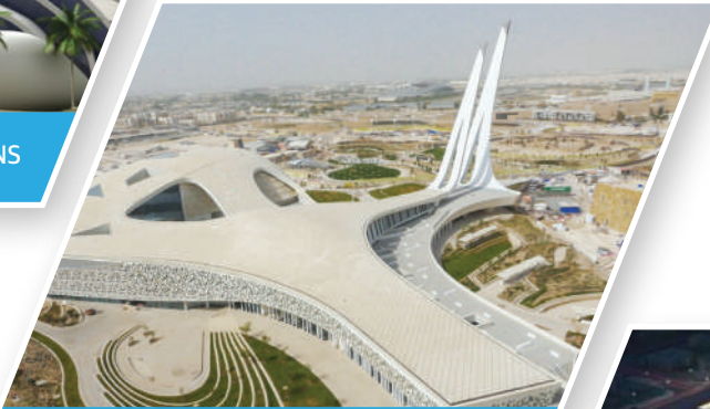
THE QATAR FACULTY OF ISLAMIC STUDIES