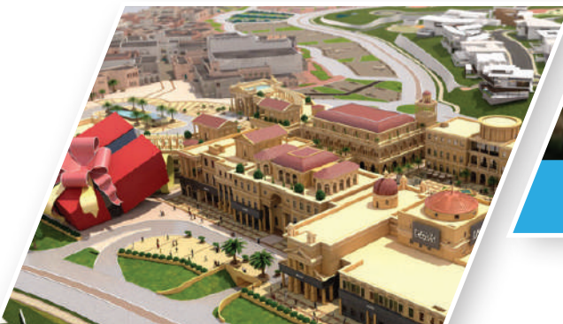
KATARA CHILDREN'S MALL