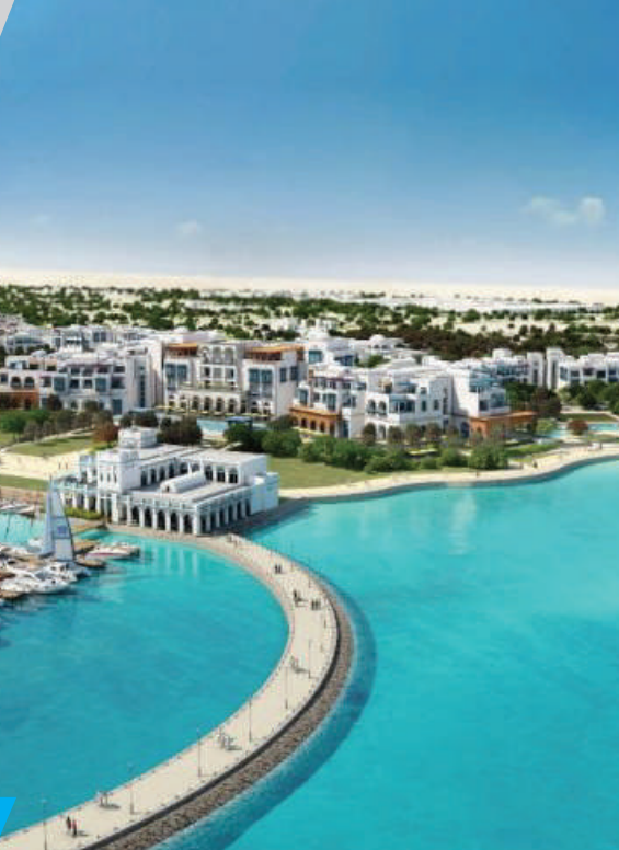
SALWA BEACH RESORT